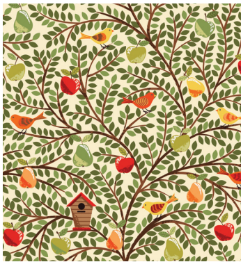
2029/Q Fruitful Tree