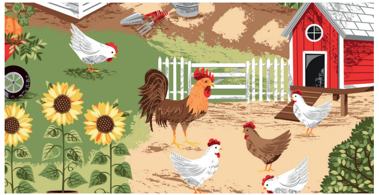
2024/1 Garden Scenic