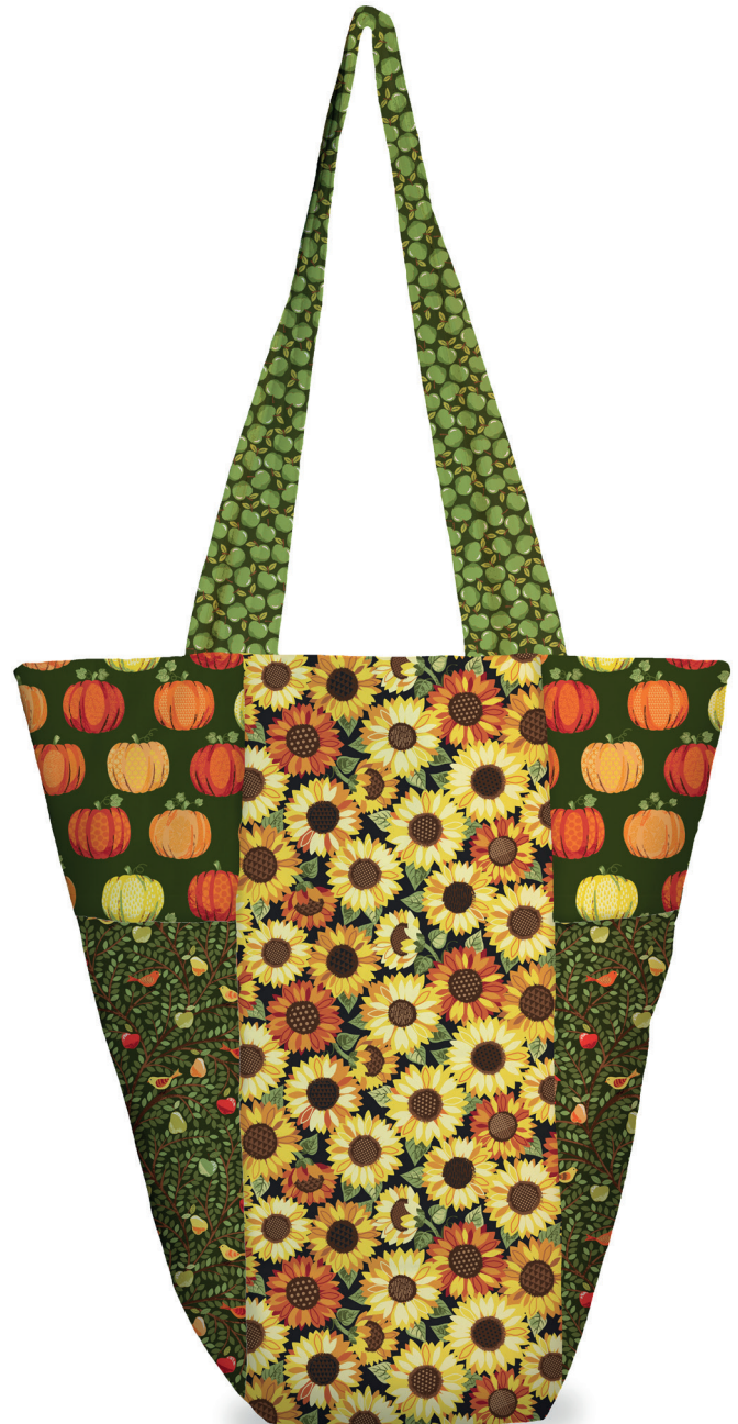
Bag B Sunflowers