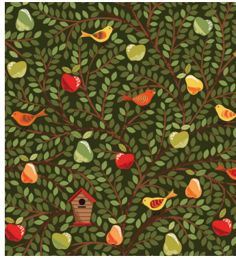
2029/G Fruitful Tree