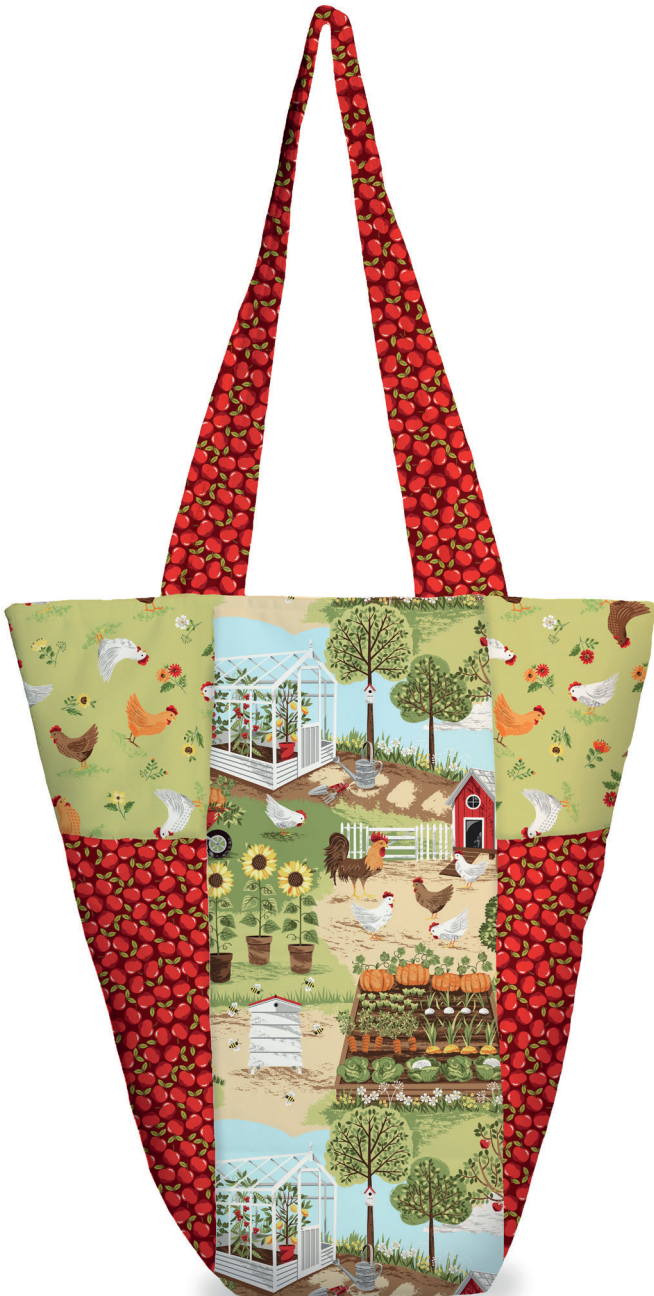
Bag A Scenic

Finished Size 16" x 14" x 5" (40cm x 35cm x 13cm) excluding handles using the Good Life collection from Makower UK www.makoweruk.com